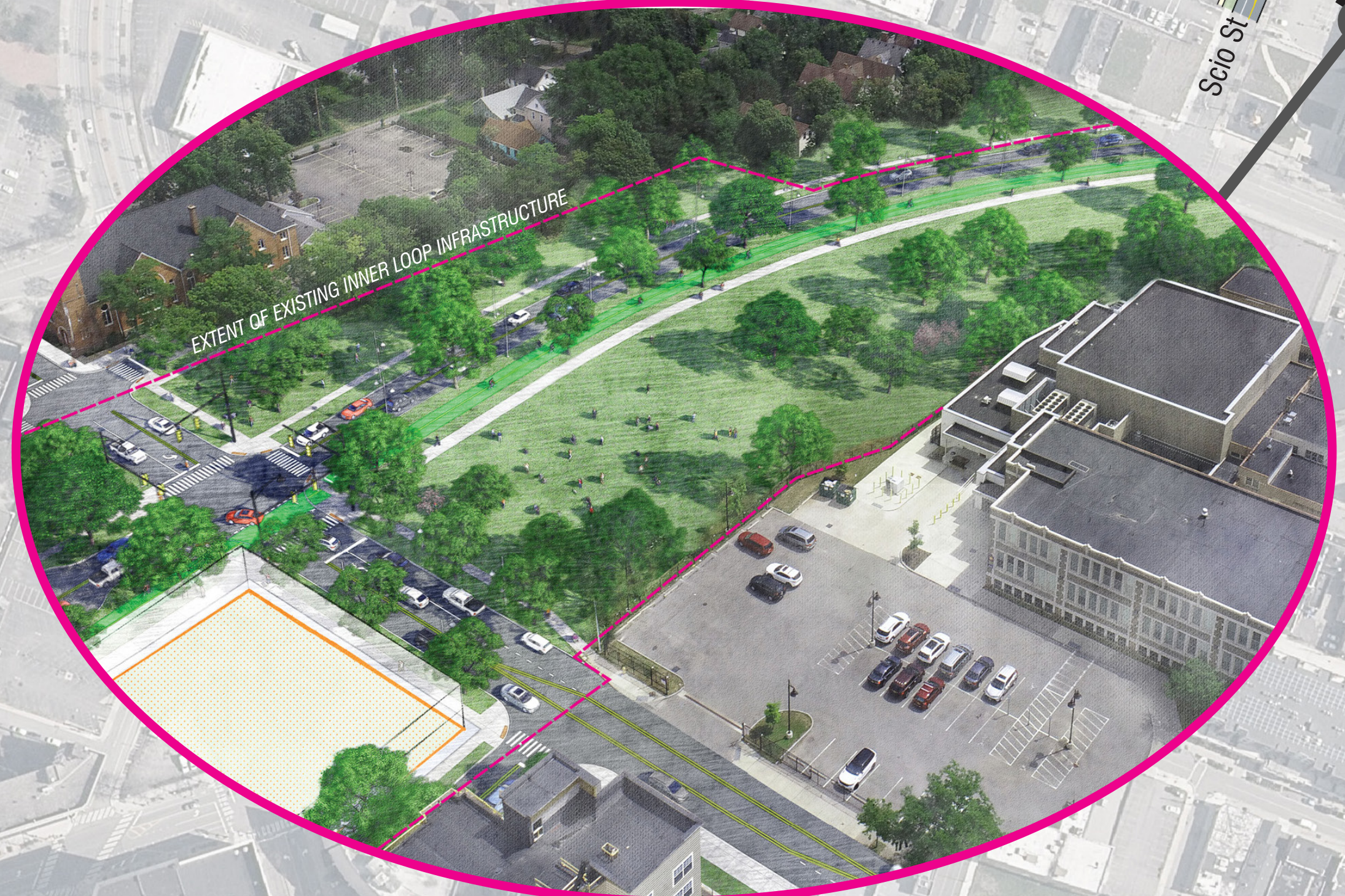
World of Inquiry Community Greenspace Increased Community Greenspace With Two Lane Road