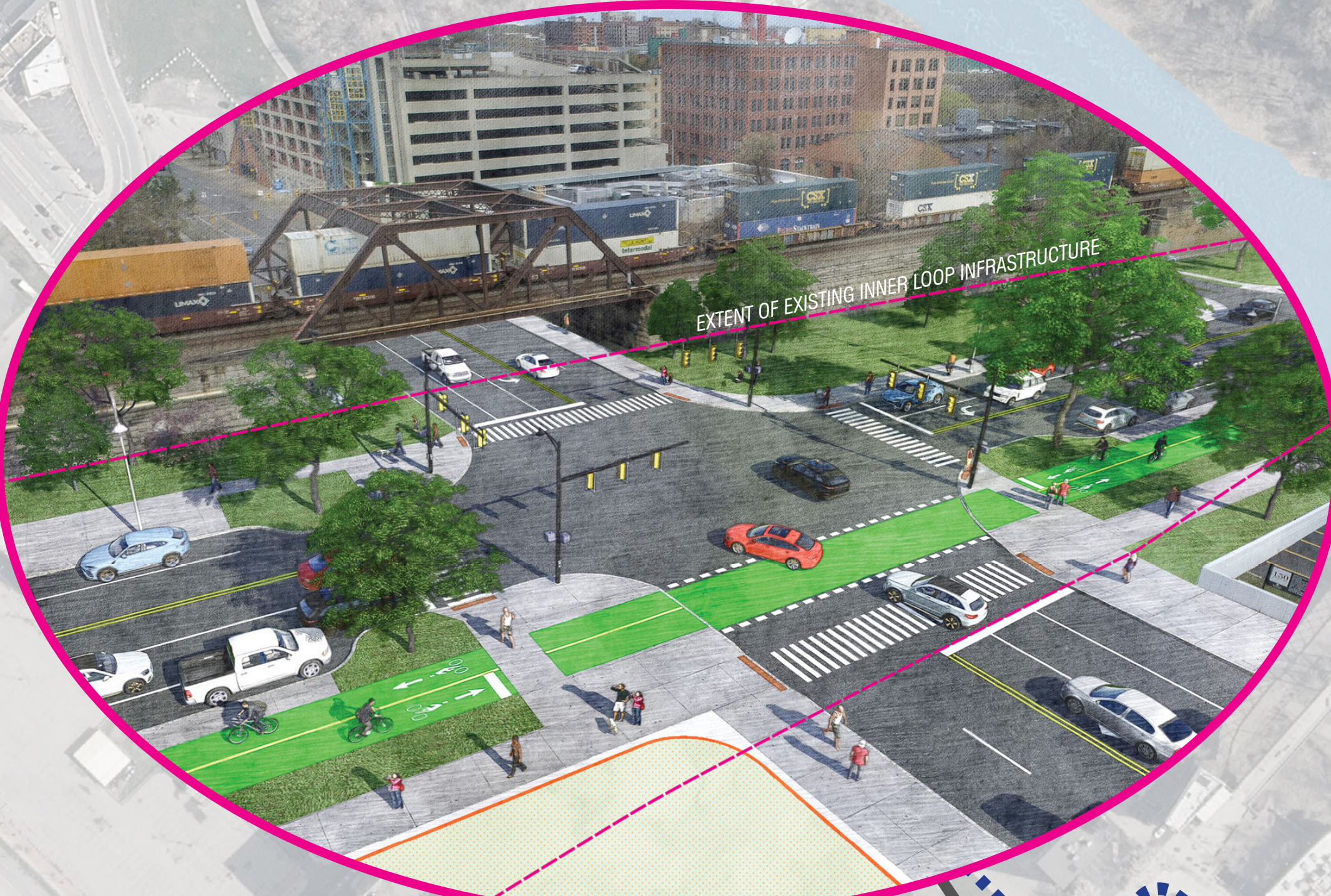
State Street Intersection Intersection Is At Grade With State Street & One Travel Lane In Each Direction With A Center Turn Lane